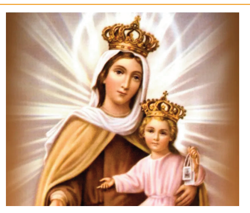
Our Lady of Mount Carmel

The Carmelite Sisters, Upper Kilmacud Road, invite you to join them in celebrating the Feast of Our Lady of Mount Carmel on Saturday 16th July.